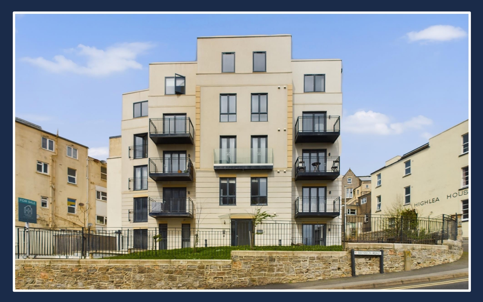
Flat 20 Manilla Crescent, Weston-super-Mare, North Somerset, BS23 2BJ